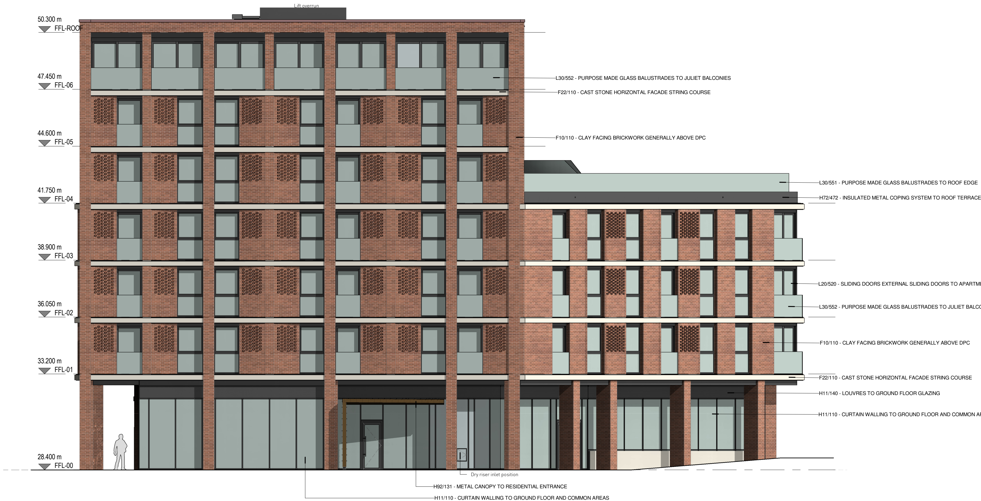
03 - Building A - Proposed South Elevation 1 : 100